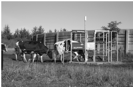
Fig 2. Selection gate.