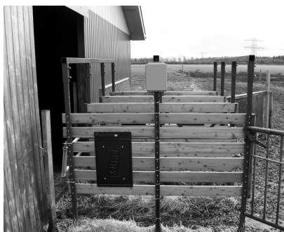
Fig 3. Gates with RFID scanner