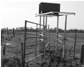
Fig 1. Timer connected gate.